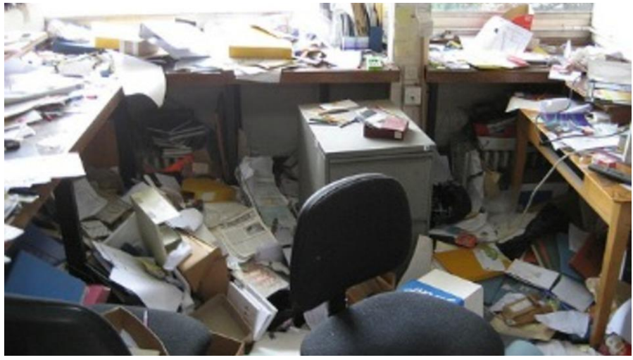
House seriously damaged after renting it through Airbnb

NYTimes: Raped, Literally, By the "Sharing Economy"